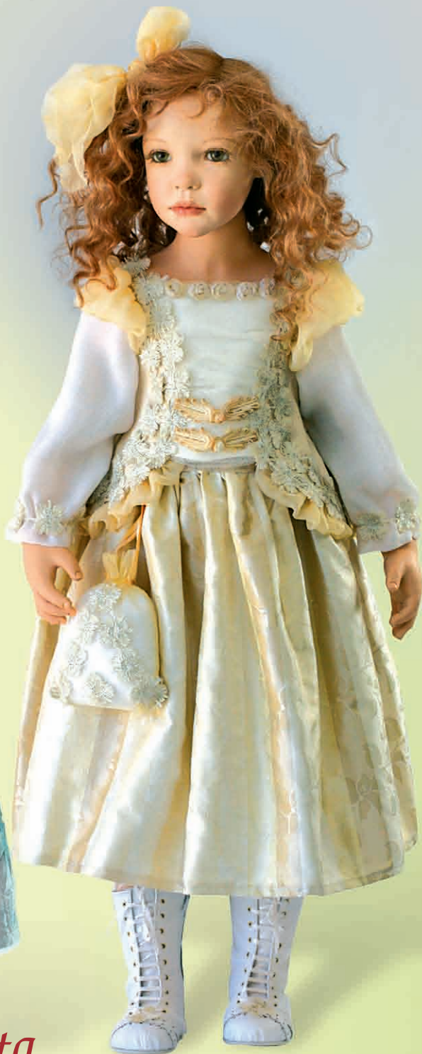
Julianna 31" LE 70