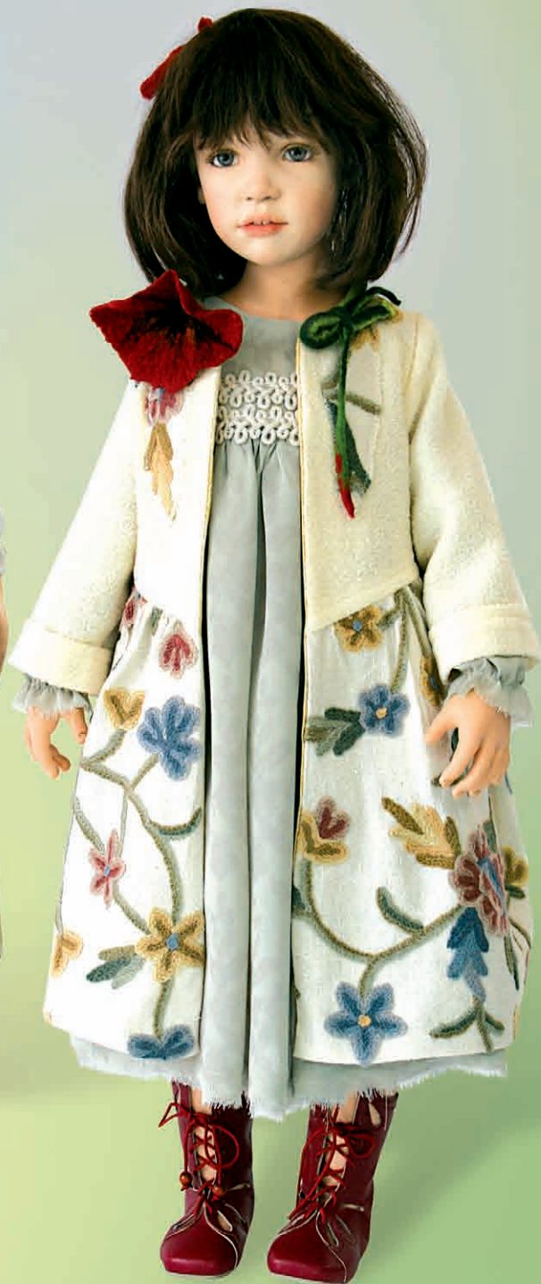
Arletta 33" LE 50