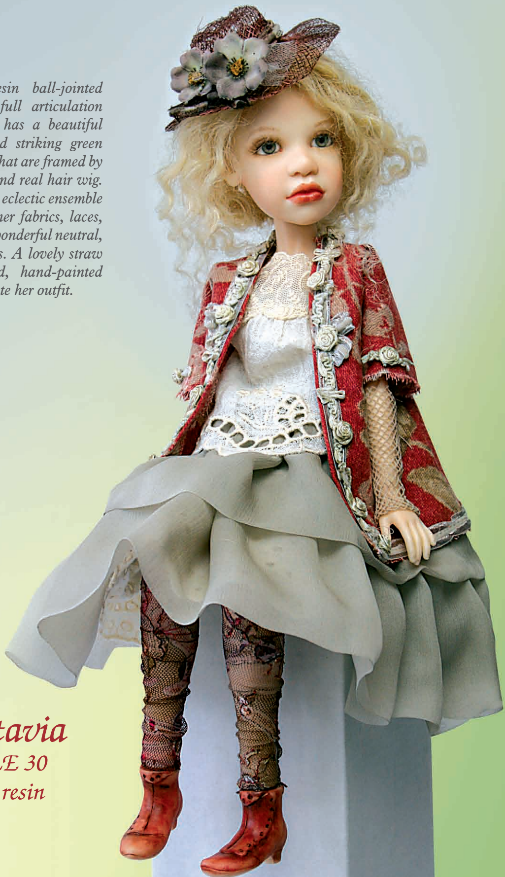
Oktavia 18" LE 30 BJD resin

Oktavia is resin ball-jointed doll (bjd) with full articulation - 15 joints. She has a beautiful artist face-up and striking green Masterpiece eyes that are framed by a softly curled blond real hair wig. Oktavia wears an eclectic ensemble sewn from gossamer fabrics, laces, silk and linen in wonderful neutral, red and grey tones. A lovely straw hat and sculpted, hand-painted resin shoes complete her outfit.