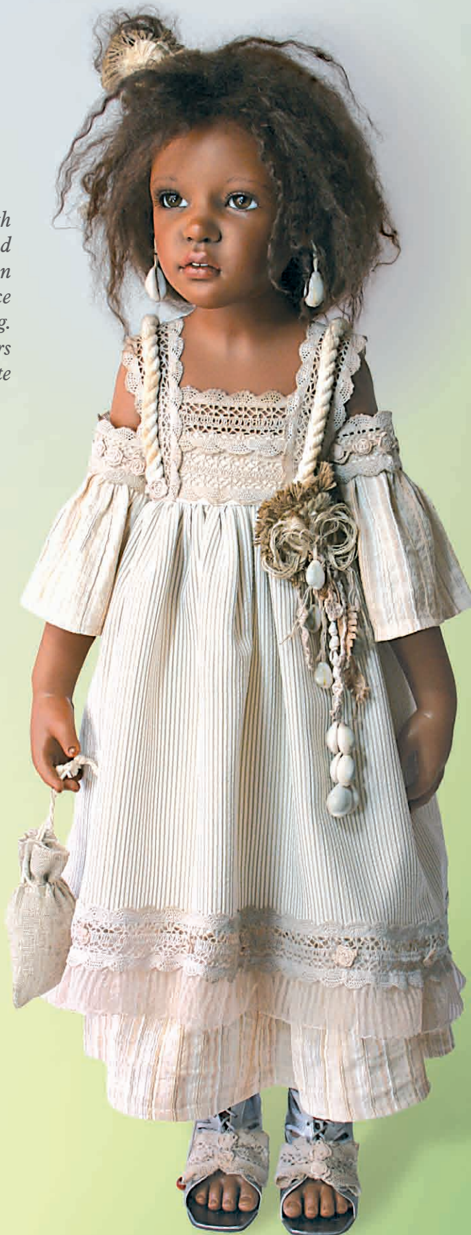
Camella 31" LE 30 vinyl

Camella is vinyl doll with a hand-painted face and brown mouth-blown German glass eyes. Her beautiful face is framed by a real mohair wig. A lovely dress of neutral colors and leather sandals complete her sweet look.