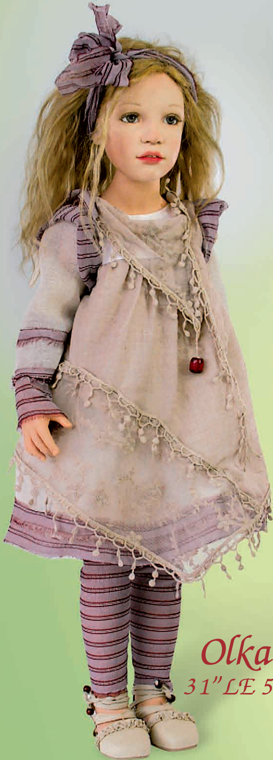
Olka 31" LE 50