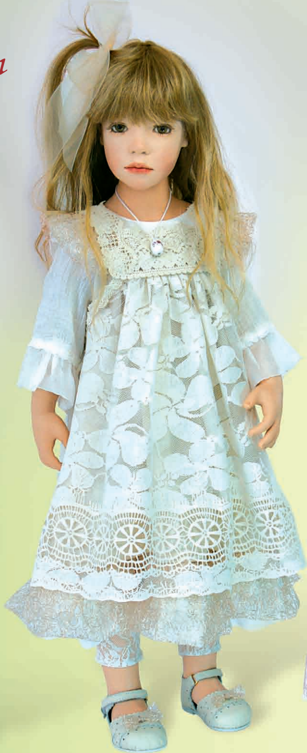
Alutka 29" LE 70