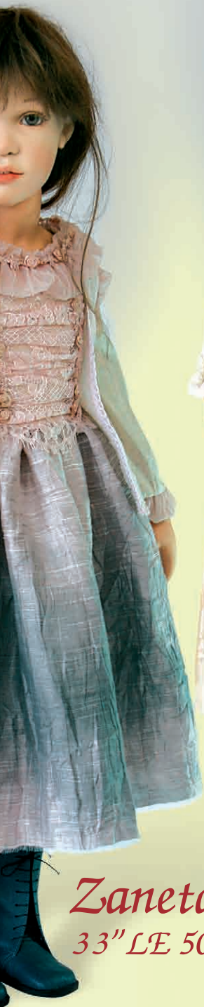
Zaneta 33" LE 50