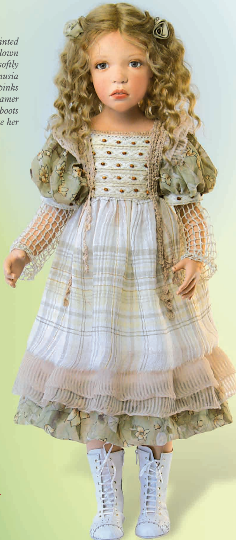
Hanusia 32" LE 50 vinyl

Hanusia has beautiful hand-painted face and gray-blue, mouth-blown German glass eyes, she has a softly curled blond real hair wig. Hanusia wears a darling dress of soft pinks and neutrals sewn from gossamer fabrics. White lace-up leather boots and rosettes in her hair complete her feminine look.