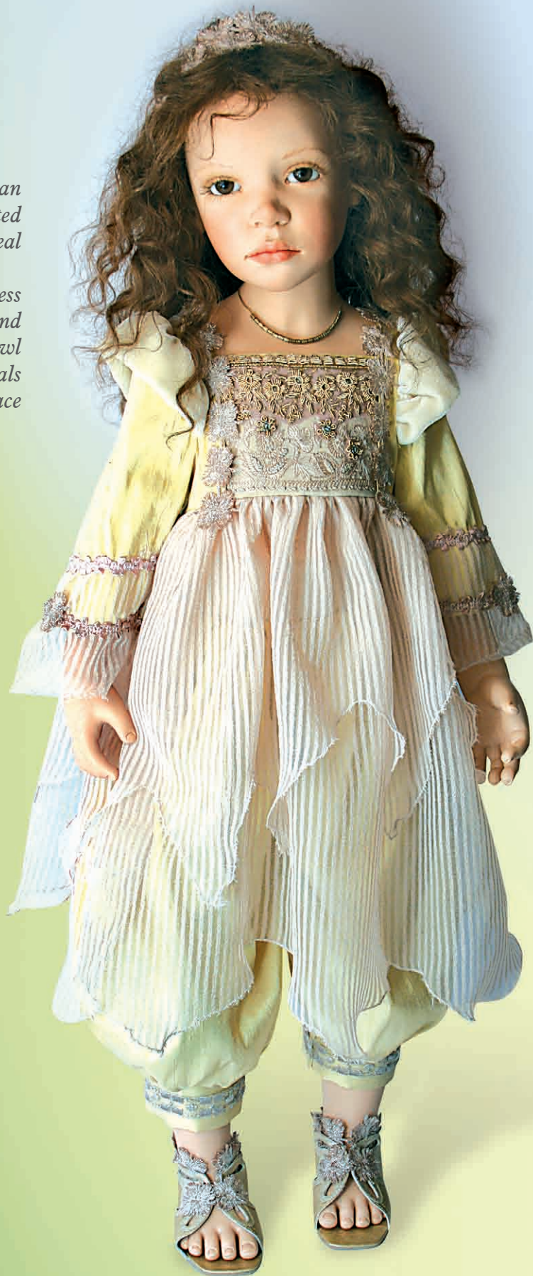
Kristina 31" LE 50 vinyl

Kristina looks like a princess with her tiara made from lace and delicate outfit in shades of pearly yellow and peach. Leather sandals and a simple, but elegant necklace complete Kristina's elegant look.