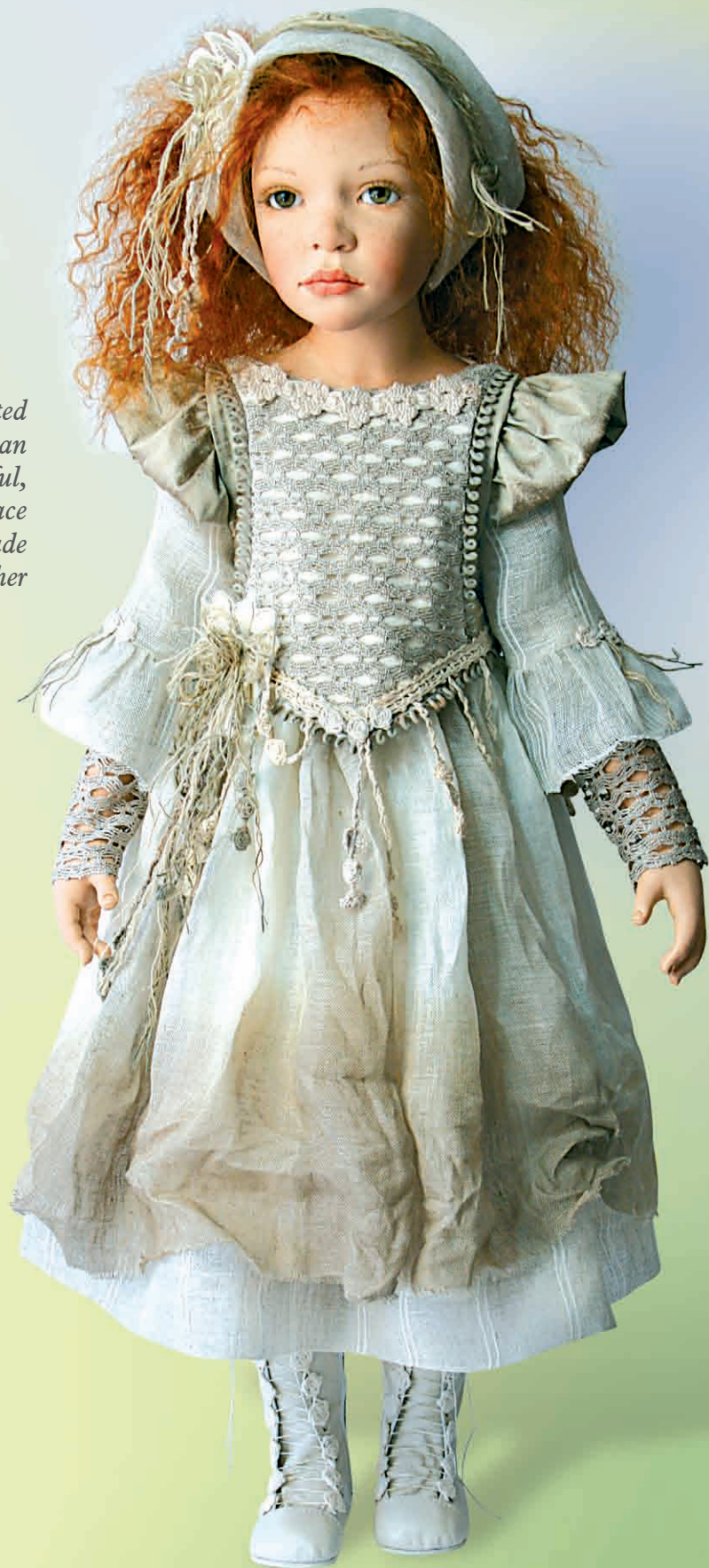
Arina 32" LE 50 vinyl

Arina has beautiful hand-painted face and mouth-blown German glass eyes are framed by a beautiful, red, real hair wig. She wears a lace and linen dress with hand made decoration and lace-up leather boots.